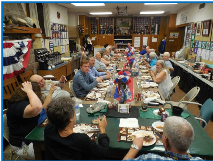
Great Company of Family & Friends at the Steak Roast